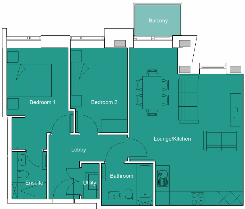
APARTMENT PLAN SCALE 1:100