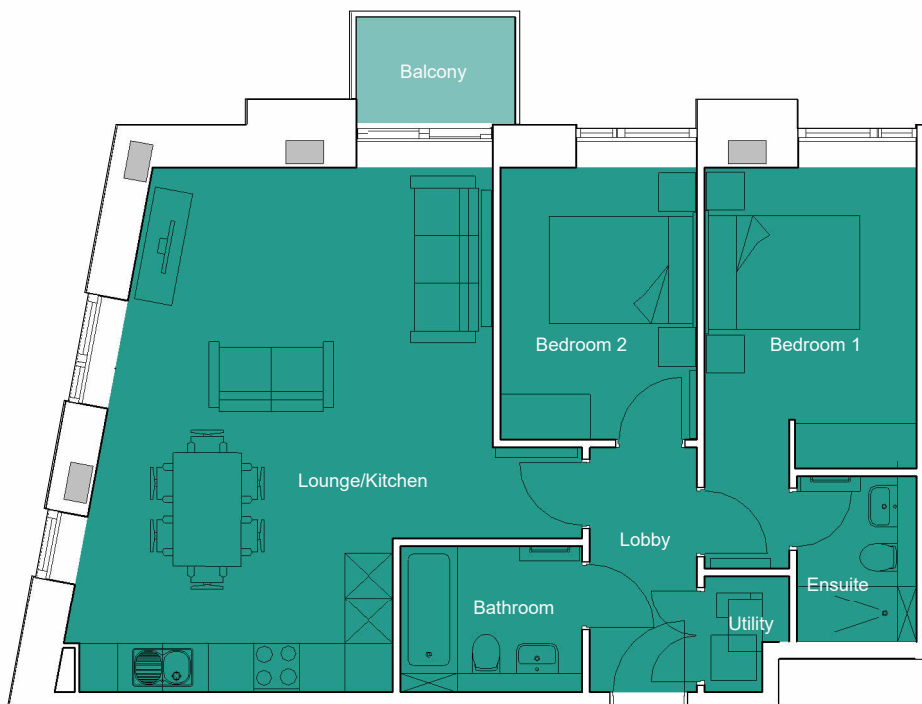
APARTMENT PLAN SCALE 1:100