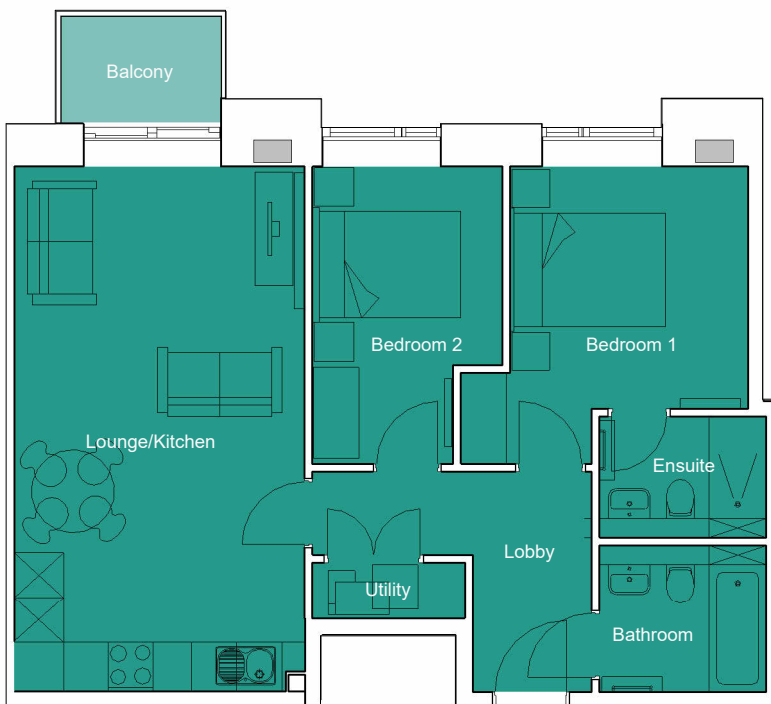
APARTMENT PLAN SCALE 1:100