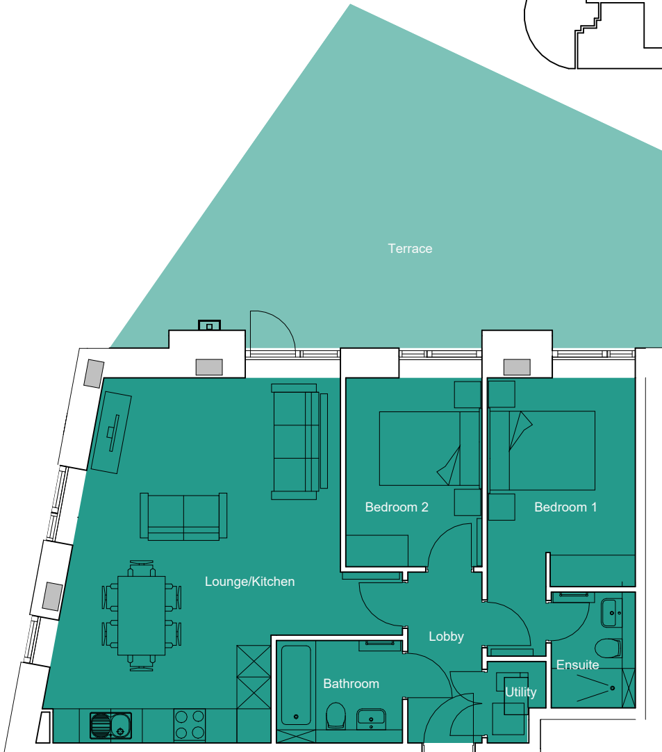
APARTMENT PLAN SCALE 1:100