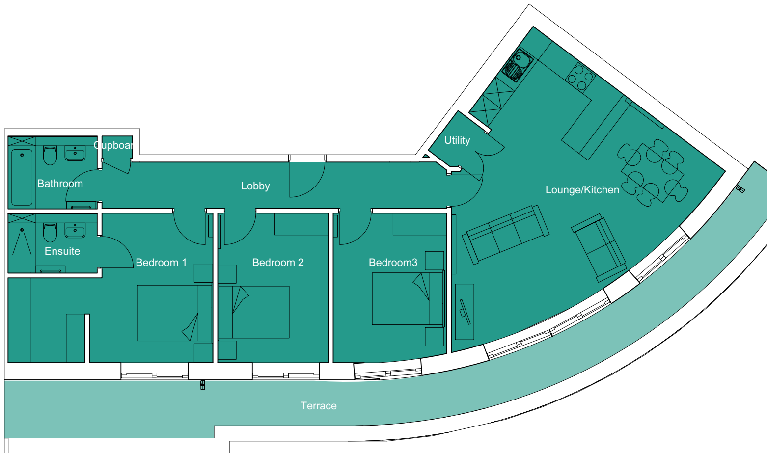
APARTMENT PLAN SCALE 1:100