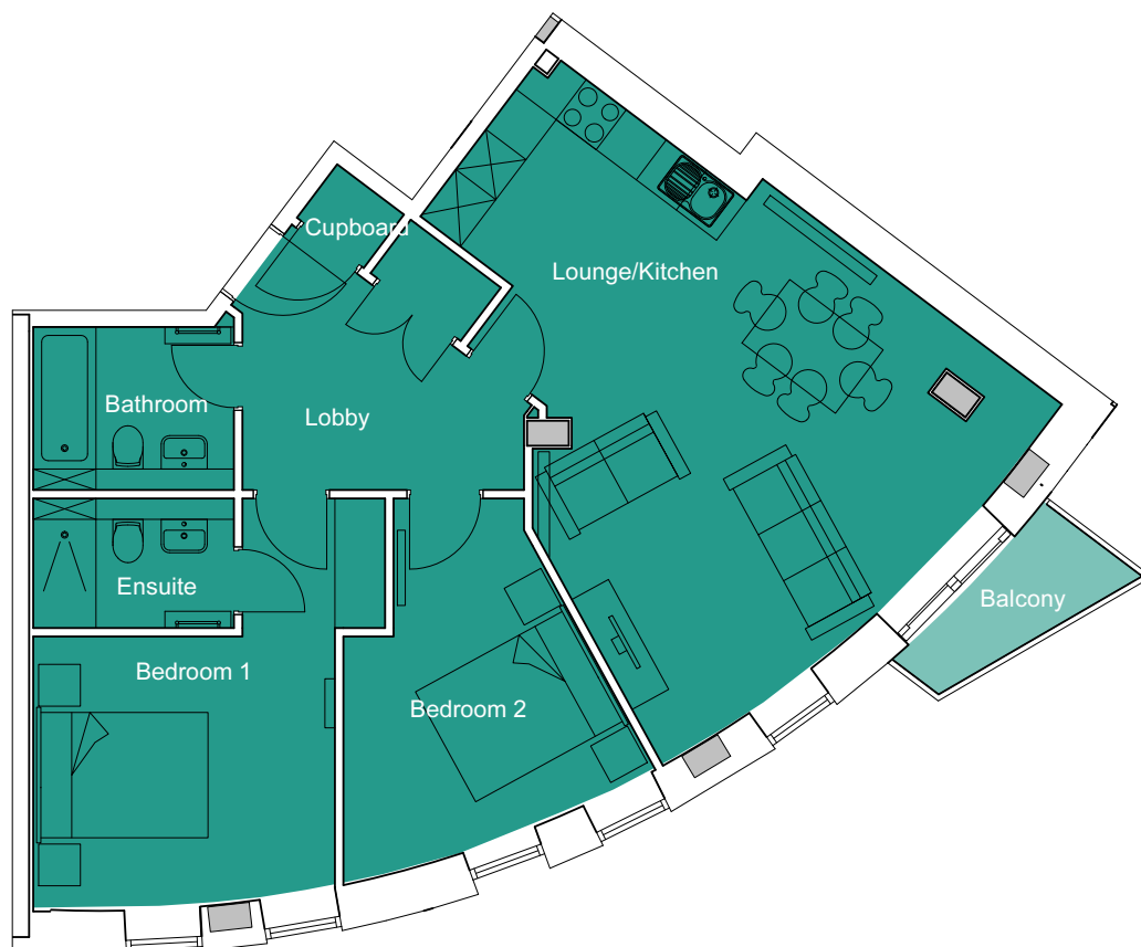
APARTMENT PLAN SCALE 1:100