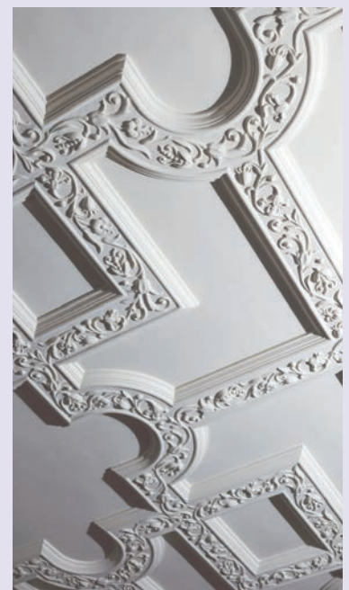
Photography taken pre-restoration