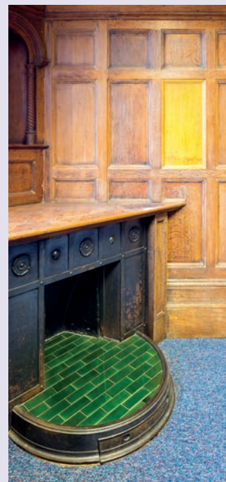
Photography taken pre-restoration