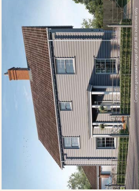
Computer generated image of plot 36 is indicative only