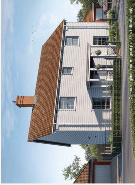
Computer generated image of plot 35 is indicative only