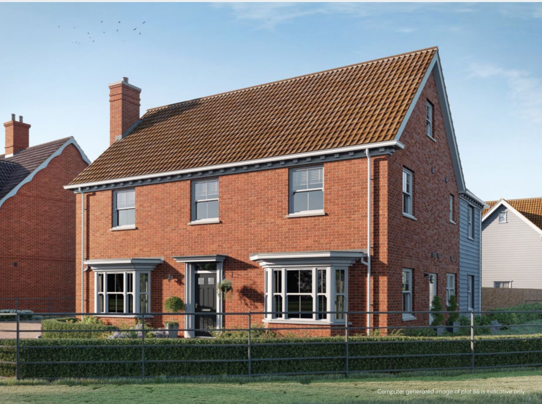
Computer generated image of plot 86 is indicative only