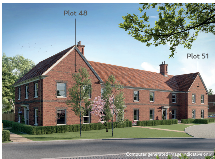
Computer generated image indicative only