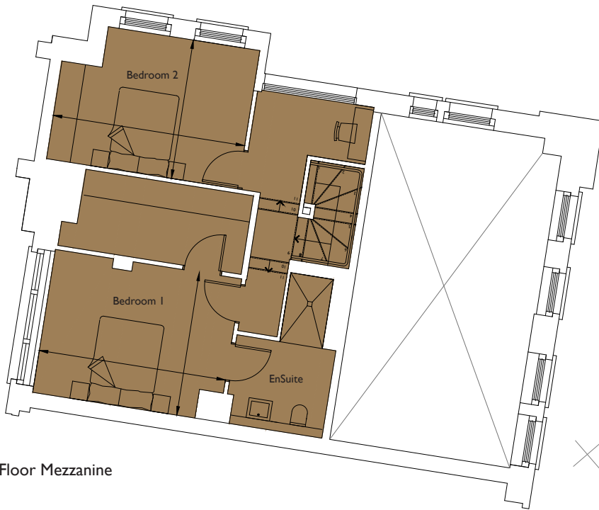
First Floor Mezzanine