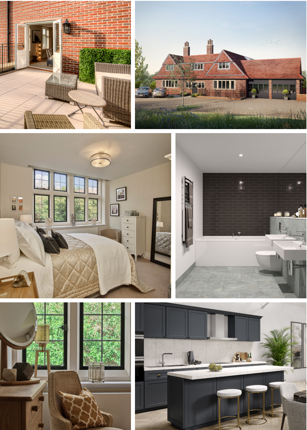
Photography shown of similar City & Country properties. Computer generated images are indicative only.