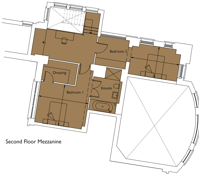
Second Floor Mezzanine